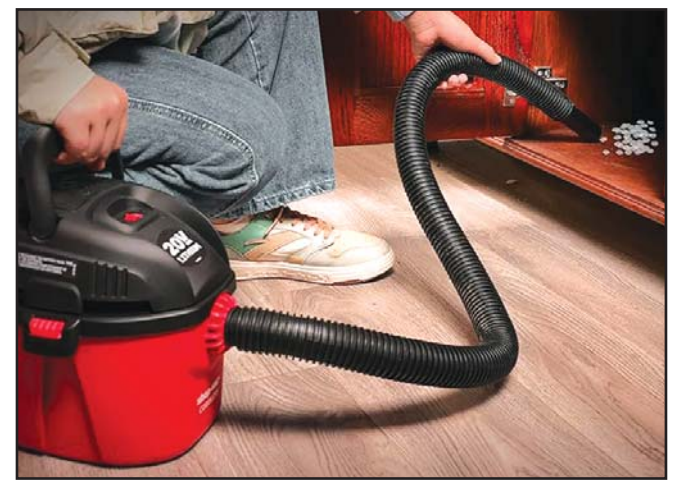
Suck up your messes with portable power! Use a batterypowered Shop-Vac, like this one gallon model.

This one gallon model costs about $80 from Amazon or your local hardware store. It comes with a mounting tool, stores easily on a garage wall and uses dust collection bags so you don't have to touch the filth. (1)