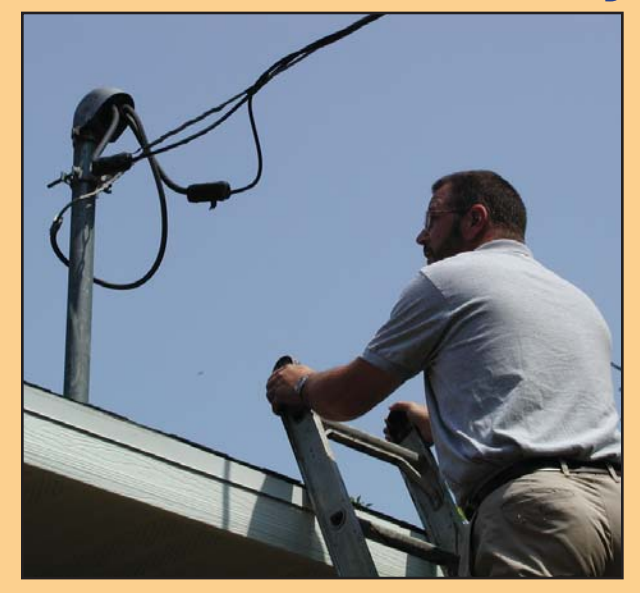
Yikes! Too close! Keep a ladder 10 feet away from power lines, including the connection to your home.

• Ladder safety includes carrying it properly! Carry long equipment, such as a ladder, horizontally to avoid bumping into an overhead power line.