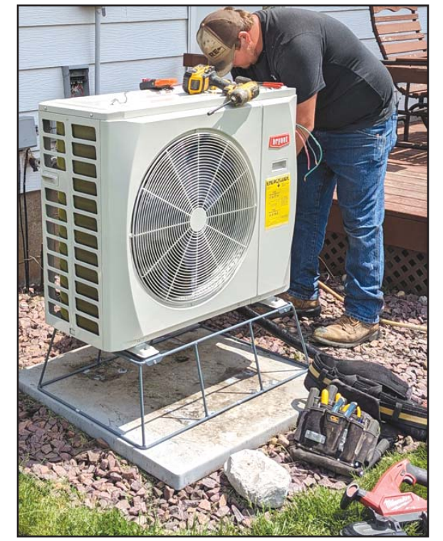
Be cool as a cucumber with a new cold climate heat pump, which is up to 300 percent efficient for lower monthly operating costs for cooling and heating.

Proper maintenance and lower use increases the life of the equipment. To find out the age of your system, look for the manufactured date printed on the